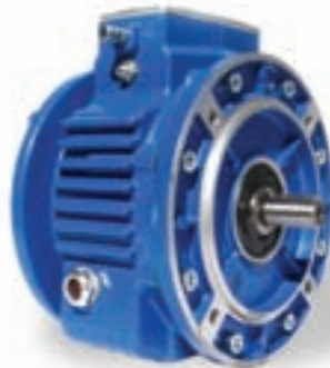
WM - Variator