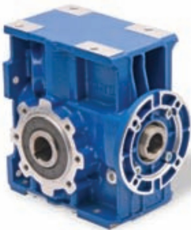
Patented 'Skew' Bevel Box