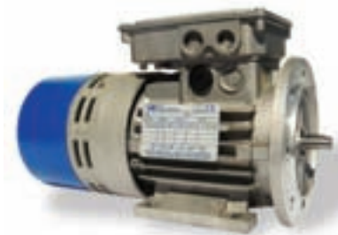
TFP - Brakemotor