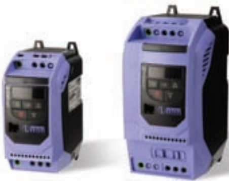
Optidrive E2 - IP 20