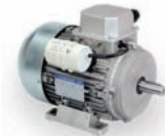
Single Phase Motor