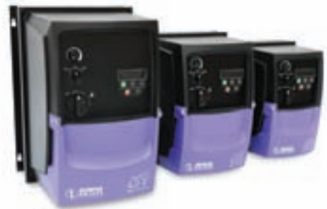
Optidrive E2 - IP 66