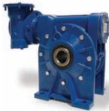
CRMI - Double Worm