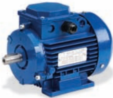
3 Phase Motor