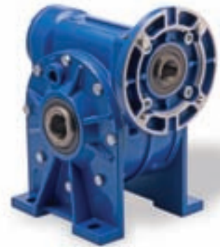
RMI - Wormbox