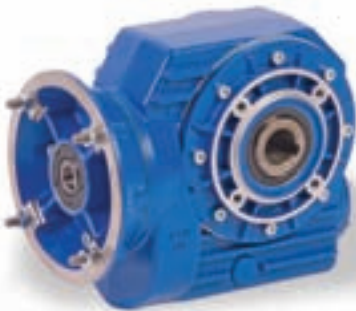
CB - Helical Worm